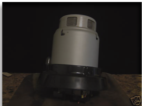
Model F3 Ionization Smoke Detector

The most commonly encountered of these older high-voltage smoke detectors were manufactured by the Pyrotronics Corporation in the 1960s. They were marketed under the model numbers F3/5, F5/B and FES.5, and using the trade name “PYR-A-LARM.” The photos that follow show examples of these detectors. (As a result of a series of business transactions, the legacy of Pyrotronics Corporation has been merged into Siemens AG - Building Technologies Division.)