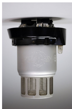
Model F5/B Ionization Smoke Detector